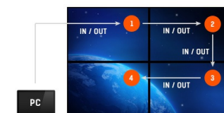
Daisy Chain Support

Thanks to Android OS, you can easily customize the display to your needs by installing applications directly to it.